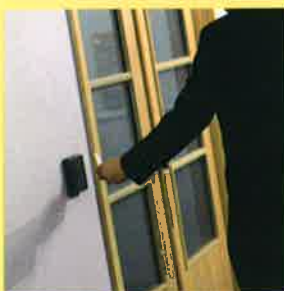
controlled access system