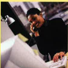
clean working environment