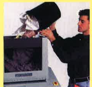
bulk waste disposal