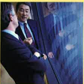
gain confidence from others

Next time you throw away a piece of paper or storage media from your table, think again. It could contain information which is so valuable to others that customised data mining strategy is deployed to collect.