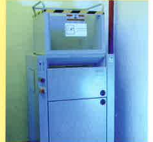
vacushred shredding machine