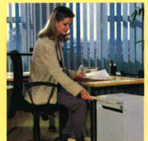
easy to use